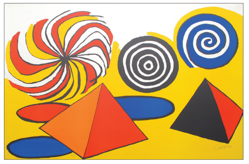
Alexander Calder, Pyramid et Spirals (Pyramid and Spirals) , 1975. Anonymous gift, 1987.50

Artist Alexander Calder was one of the most innovative artists of the 20th century. He invented the mobile, a type of sculpture that moves, when he wanted to make drawings in the air. He was fascinated by shapes and frequently used circles, pyramids, and spirals in his paintings and drawings.