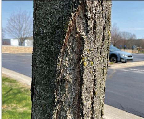
Actual texture: Photograph showing the actual texture of tree bark.

Texture is an art element related to how something feels ( actual texture ) or how something looks like it would feel ( implied texture ) when it is touched. Actual texture uses our sense of touch. Implied texture uses our sense of sight.