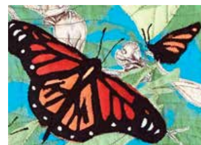
Ann Jacob, Faculty

SA (10 wks) 9/16-11/18 9a-12p FB-102 Tuition $243 SA (10 wks) 9/16-11/18 1p-4p FB-103 Tuition $243