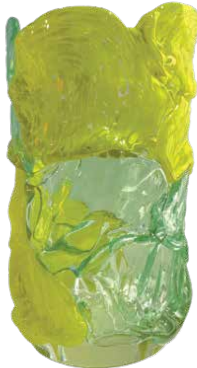
Brent Swanson, Faculty

Anthony Lopez SA (7 wks) 9/16-10/28 6p-9p GL-75 Tuition $294 TH (7 wks) 9/21-11/2 2p-5p GL-76 Tuition $294