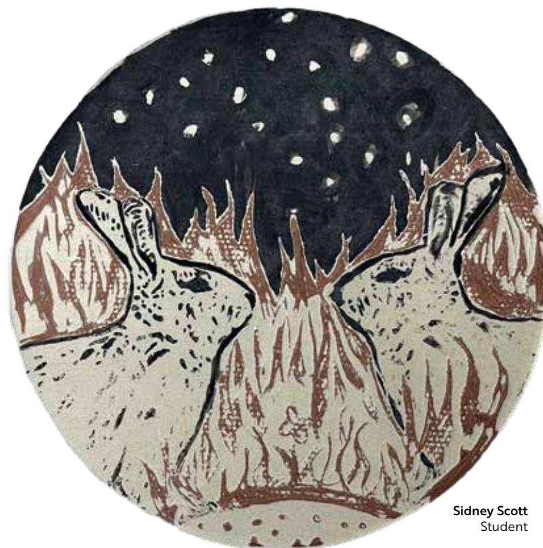
Sidney Scott Student

Students with some clay experience will work on specific personal projects with instructor guidance and support. Instruction will include alternatives for surface decoration and different firing techniques for special effects.