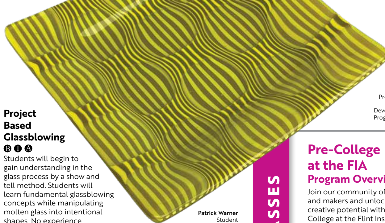
Patrick Warner Student

3/28-5/16 TH (7 wks) 10a-1p No class 4/18 Tuition $294 GL-79