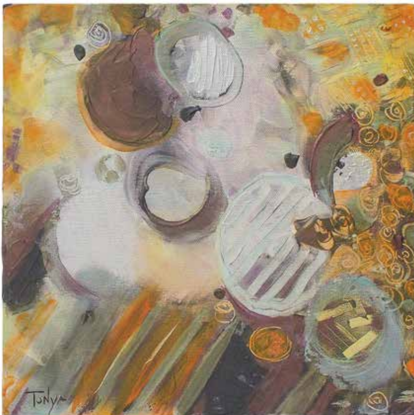
Tonya Henderson , Faculty

MO (8 wks) 1/9-2/27 12p-3p PA-30 Tuition $288