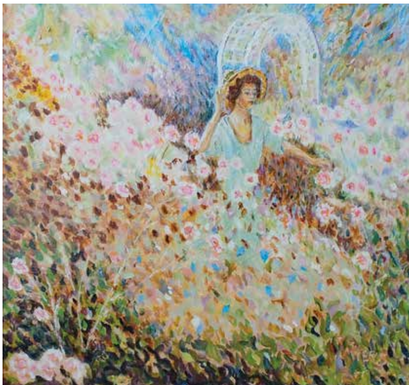
Thomas Myers, Student

The Art School's Winter Workshops provide students the opportunity to try something new; to experiment; or to do a deep-dive into a specific technique or idea. Workshops vary in length and structure from regular course offerings. The regular Winter term will begin on January 2.