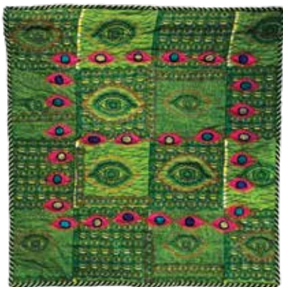
Jane Reiter, Faculty

SA (2 days) 12/10-12/17 10a-2p FB-82 Tuition $64