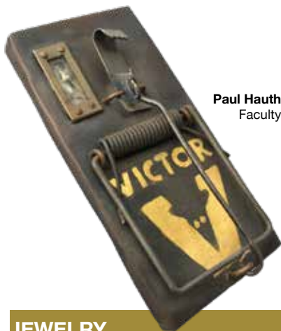
Paul Hauth Faculty

The FIA Art School offers classes for all skill levels in drawing, painting, ceramics, fiber, mixed media, and photography. Please see notations for individual class levels. The FIA strives to create an encouraging environment for students to explore the creative process at their own pace. Beginning students are encouraged to start with basic drawing and entry-level classes. Unless otherwise noted, students are expected to provide their own supplies. A supply sheet will be provided for each class either before class begins or at the first class.