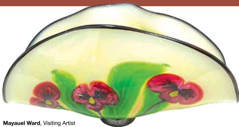
Mayaue Ward, Visiting Artist

FR (1 day) 12/9 3p-4p GL-108 Tuition $35