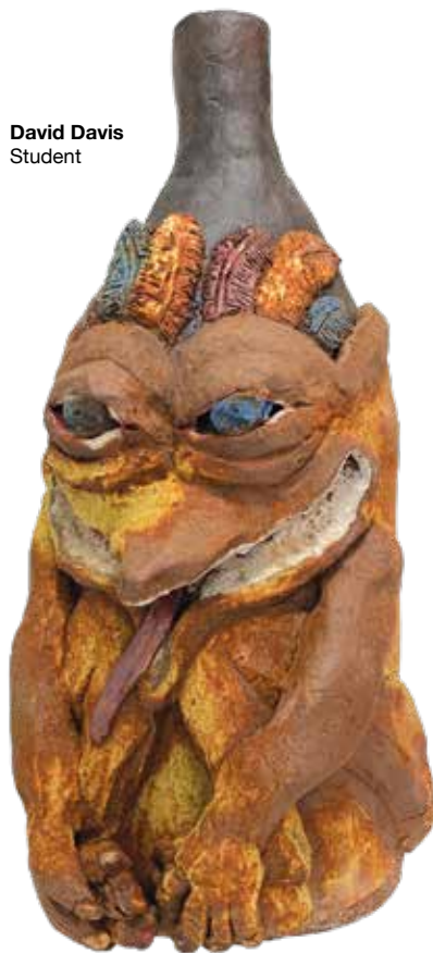
David Davis Student

TH (2 days) 12/8-12/15 1p-5p CR-88 Tuition $90