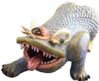
Gwen Darling, Faculty