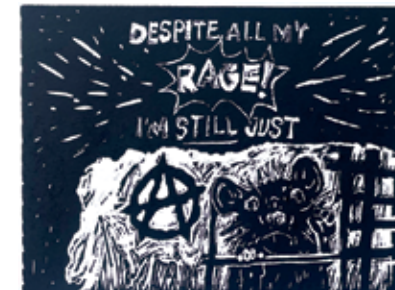
Nic Custer, Student

Janice McCoy TH (4 wks) 2/8-2/29 6p-9p PR-94 Tuition $140