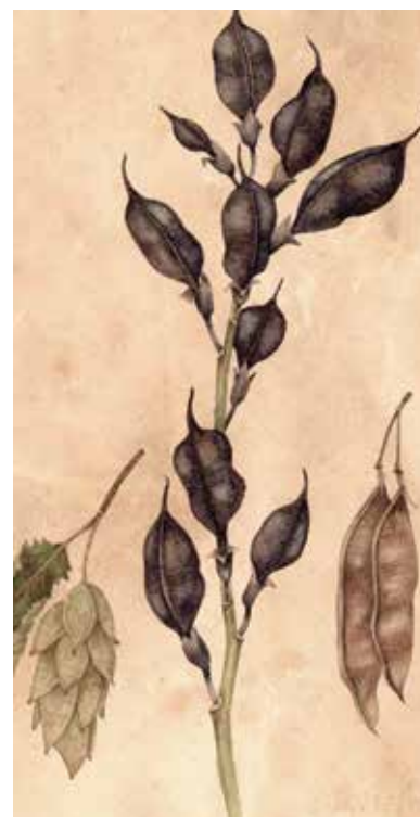
Barbara Holmer, Faculty

SA (1 day) 2/10 10a-2p DR-23 Tuition $60