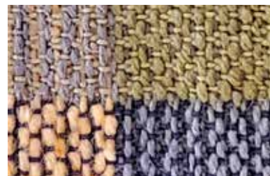
Alice Foster-Stocum, Faculty

Alice Foster-Stocum SA (9 wks) 1/13-3/9 9a-12p FB-91 Tuition $220 SA (9 wks) 1/13-3/9 1p-4p FB-92 Tuition $220