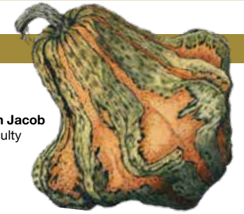
Ann Jacob Faculty

TH (9 wks) 1/11-3/7 5:30p-8:30p DR-72 Tuition $320