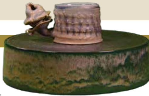
Noah Zirpoli, Faculty