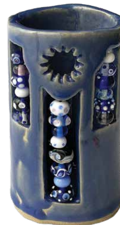
Alysia Trevino , Student