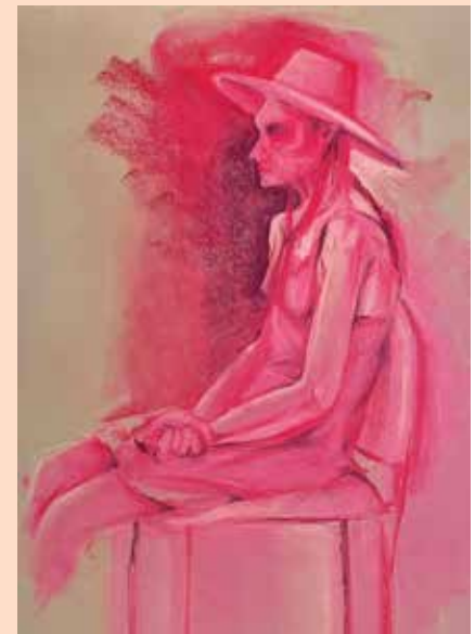
Jillian Guise, Student

More information and application materials are available at flintarts.org/programs/pre-college-portfolio-development-program .