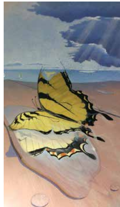
Jim Gould, Faculty

FR & SU (7 wks) 1/12-2/25 5:30p-8:30p No class 1/26 & 1/28 PA-64 Tuition $378