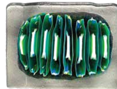
Terri Walker , Student

WE (2 days) 12/6 & 12/13 9:30a-2p CR-53 Tuition $150