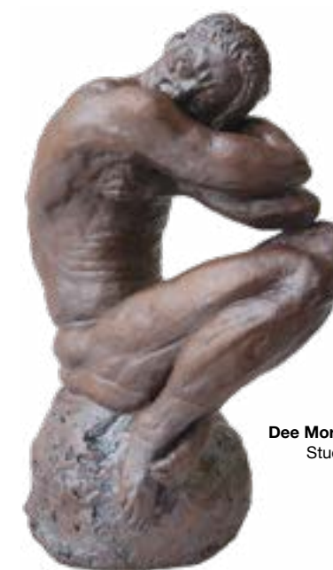
Dee Moreno Student

MO (9 wks) 6/3-7/29 5:30-8:30p Studio 11 PR-34 Tuition $195