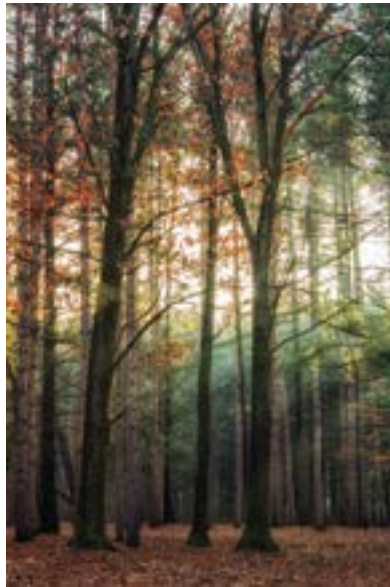
Brian O'Leary, Student

WE (6 wks) 6/19-7/24 5:30p-7:30p Studio 4 PH-90 Tuition $99