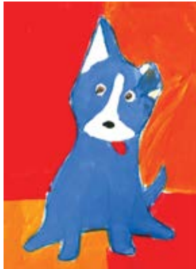
Anna Hoinka, Student

WE (5 wks) 6/12-7/17 5:30p-7p No Class 7/3 Studio 11 EC8-07 Tuition $77