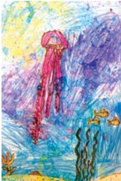
Aleena Daniels, Student

MO (5 wks) 6/17-7/15 3p-4p Studio 11 EC6-06 Tuition $52