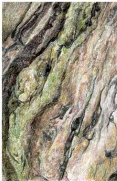
Nicki Topping, Student

TU (8 wks) 6/13-8/8 2p-5p No class 7/4 DR-126 Tuition $240