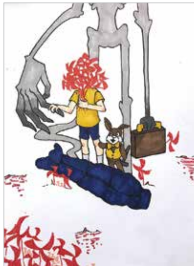
Martyn Avereyn, Student

Students ages 15 and up are welcome in many adult classes. Please see adult course descriptions.