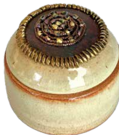
Marshall Sanders & Sharon Simeon Students

Karyn Konkol WE (8 wks) 6/14-8/9 9:30a-1:30p No Class 7/5 CR-100 Tuition $360