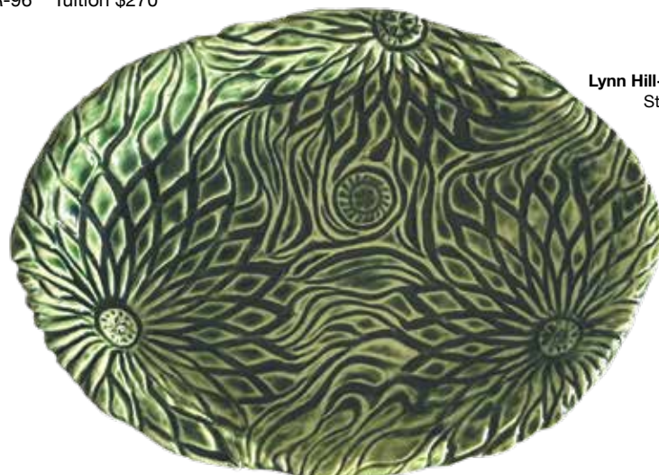
Lynn Hill-Funk Student

Gwen Darling SA (6 wks) 6/17-7/22 10a-2p CR-96 Tuition $270