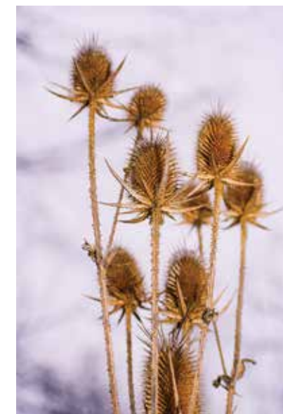
My Proulx, Faculty

Matthew Osmon TU (7 wks) 6/20-8/15 4p-6p No Class 7/4 & 7/11 FM-79 Tuition $210