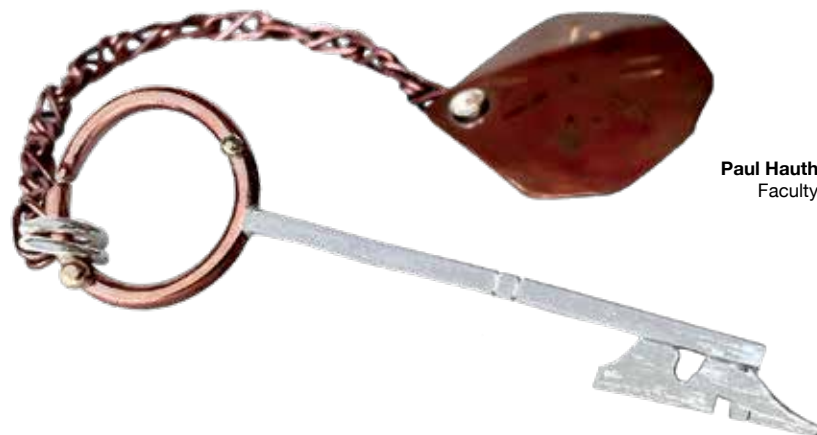
Paul Hauth Faculty

TU (5 wks) 7/11-8/8 1p-4p SC-81 Tuition $240