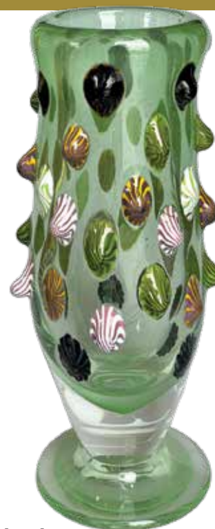
Brent Swanson & Mike Mentz, Faculty

MO (6 wks) 7/10-8/14 10a-1p JW-85 Tuition $200