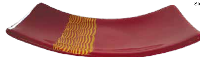
Patrick Warner Student

MO (4 wks) 7/3-7/24 1:30p-4:30p GL-86 Tuition $240