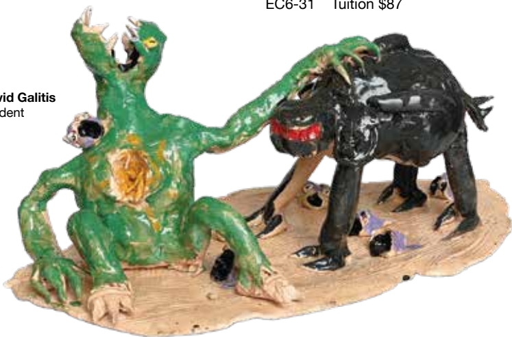
David Galitis Student

TU (7 wks) 6/13-8/1 4p-5:30p No Class 7/4 EC9-32 Tuition $130