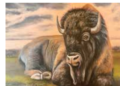
Ron Crow, Student

TH (3 wks) 6/13-6/27 12p-3p PA-60 Tuition $100