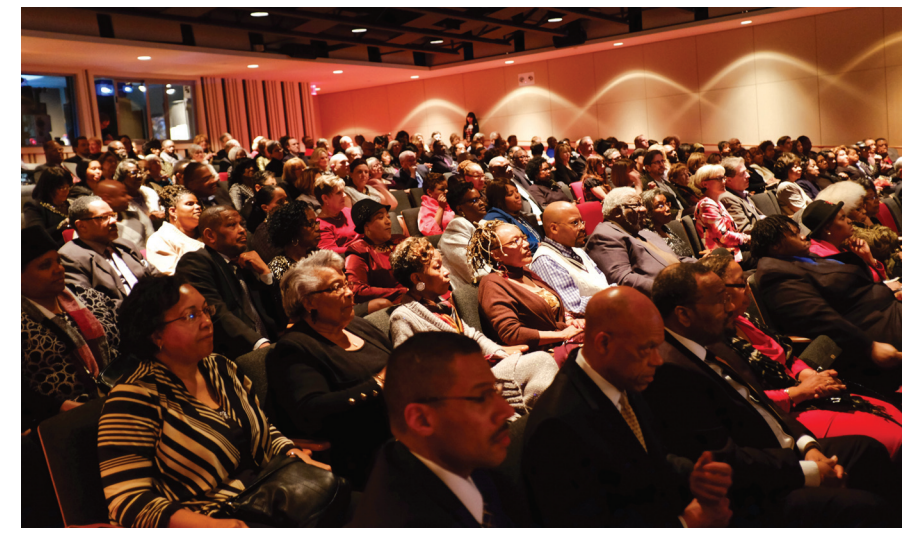
Point of View 7th Annual Community Gala