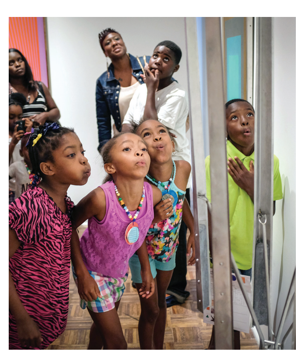
Families exploring how some sculptures move

Education programs served a total of 45,797 during the fiscal year.