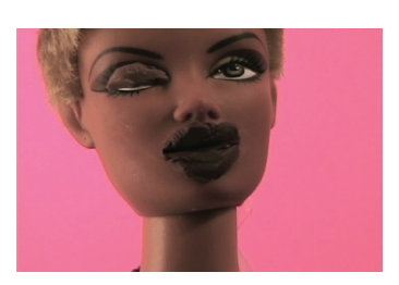
Big Gurl