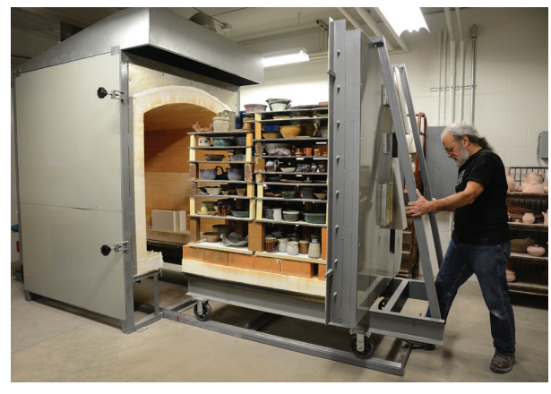
The Bailey Pro 54 kiln

The FIA Art School is dedicated to the enrichment of the community through individual academic exposure to the visual arts. Highly qualified faculty offer instruction in ceramics, drawing, painting, photography, digital arts, animation, fibers, glass mosaic, sculpture, and early childhood art courses. Since 1928, the Art School has operated continuously, helping students develop a wide range of artistic goals and skill levels. Programs are designed to support the mission of the FIA with dynamic curricula that engages students and the community through creative processes, studio experiences, and gallery exhibitions.