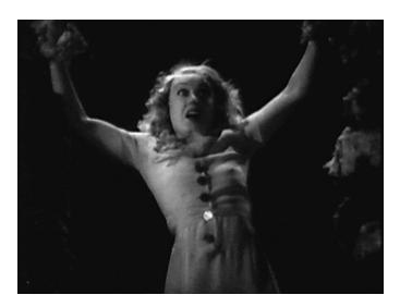
The Release Image courtesy of the Artist