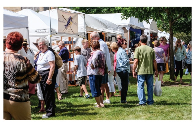
Flint Art Fair